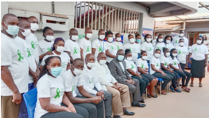
Kisii Eye Hospital staff during World Glaucoma Week

Glaucoma is an eye disease that causes progressive irreversible damage of the nerve for vision and slowly leads to blindness. It usually has no warning or obvious symptoms to detect it. It is described as the 'sneak thief of sight'.