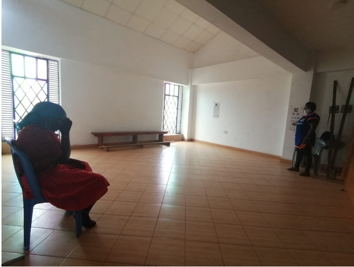
One of the patients undertaking Visual Acuity during World Glaucoma Week

We first offered patient education on glaucoma; what it is, its symptoms and its treatment to its congregation. Then we offered free consultation services to them and we also did some hospital referrals for further treatment. We screened 332 patients during this week.