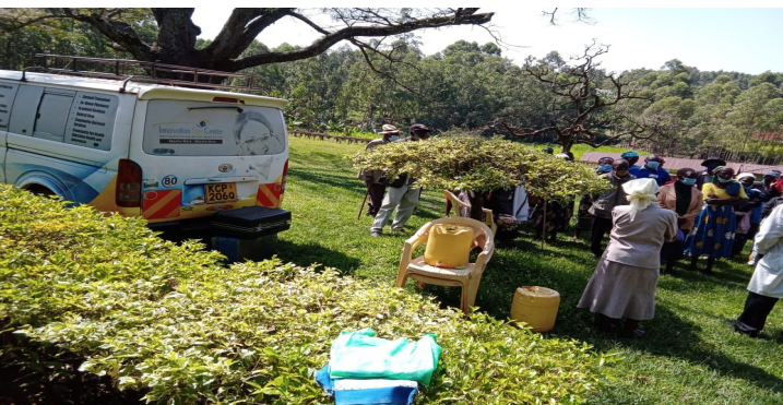
Patients being given a talk during the Sengereri camp

The CRS program is still ongoing in Mosoch, Kisii County and Gachuba, Nyamira County through our trained cataract finders. During this month, we also have conducted camps at Miriri Farmers' Society and Sengereri Chief Camp.