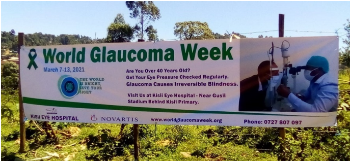
Eye Education Banner in Kisii town during World Glaucoma Week

World Glaucoma week is commemorated worldwide every second week of March every year. This year it was from 7th March, 2021 to 13th March, 2021. This year's glaucoma theme was 'The World is Bright, Save Your Sight.'