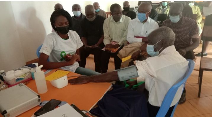
Patients waiting for eye screening during World Glaucoma Week at the Catholic Diocese of Kisii