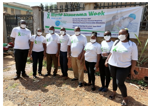
Kisii Eye Hospital staff during World Glaucoma week at the Catholic Diocese of Kisii

Our main objective during this week; our objective was to create awareness and sensitization about Glaucoma. We conducted a two-day camp at the Catholic Diocese of Kisii County.