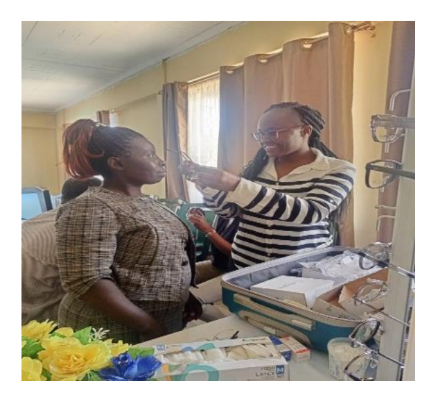
Patients during an eye camp