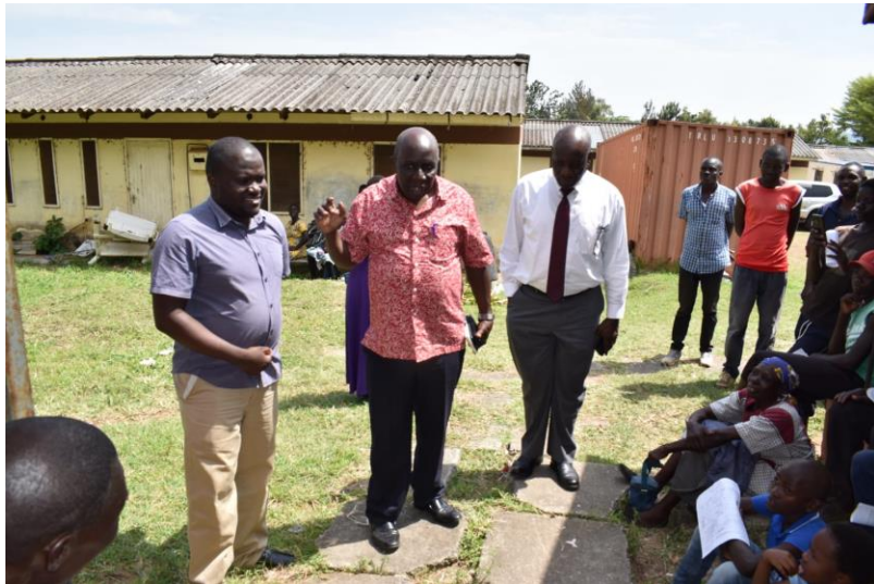
Patient Health talk