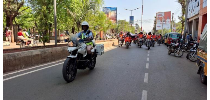
Boda Boda riders during their procession through Kisumu CBD