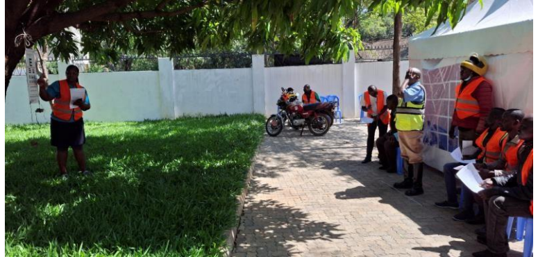
Visual Acuity taking