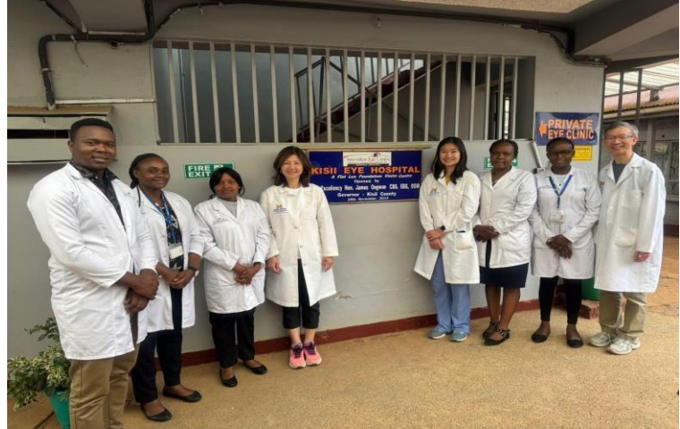
Innovation Eye Centre Optometrist Staff with Visitors from Kellogg Eye Center