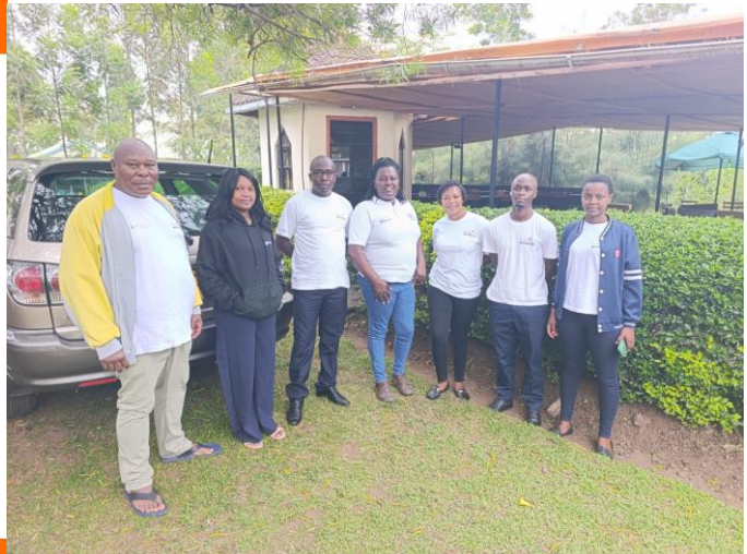
The Innovation Eye Centre Screening team