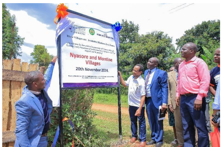
Avoidable Blindness-Free village billboard.