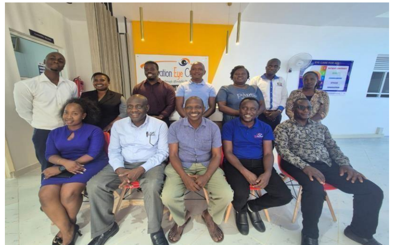
Kitale Eye Hospital, Innovation Eye Centre and City Eye Hospital Team City at Innovation Eye Centre -Kisumu.