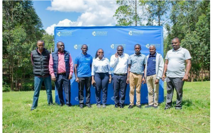
Innovation Eye Centre and Operation Eye Centre Team