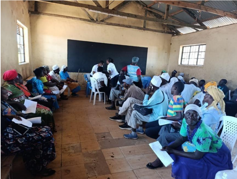
Patients waiting in queue at Nyang'ande Outreach