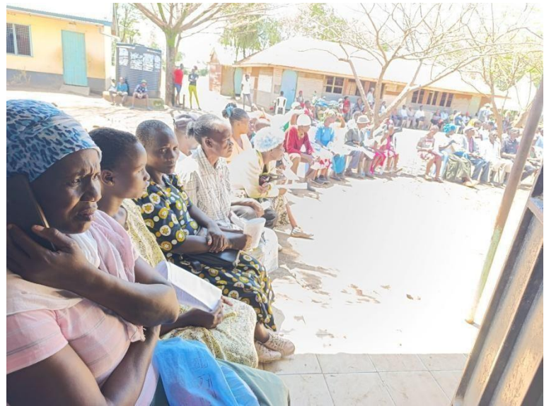
Patients waiting in queue at Nyang'ande Outreach