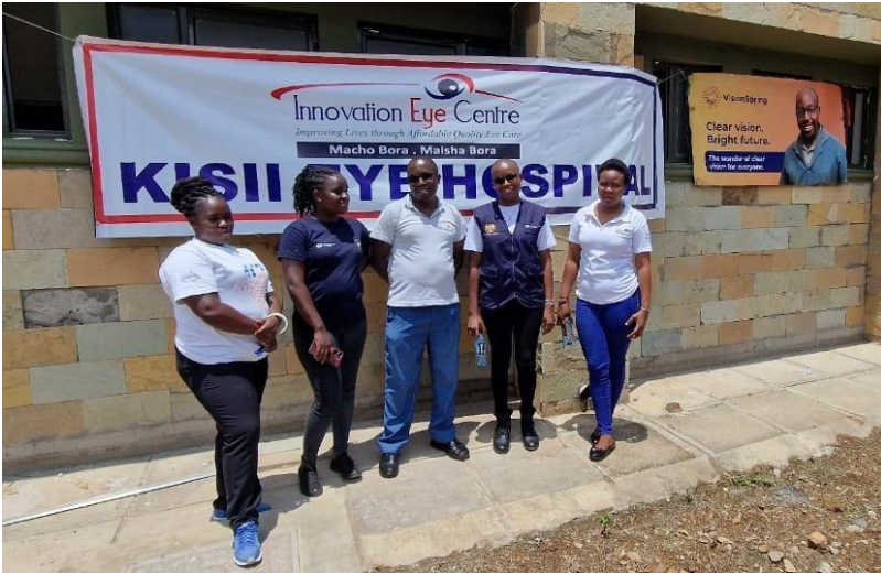
Innovation Eye Centre Staff

During the camp, a dedicated team of eye care professionals screened 114 individuals and offered comprehensive eye examinations and consultations.