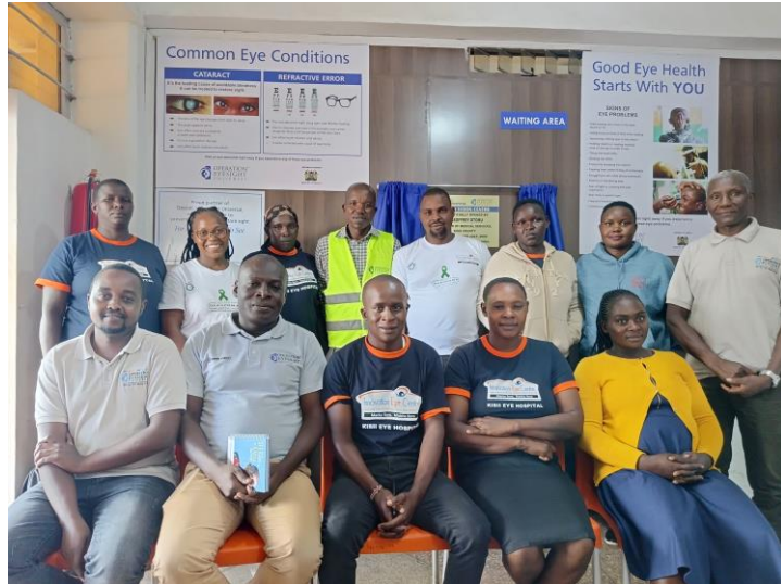
Keroka Vision Centre CHPs, OEU team and Kisii eye Hospital team at the Vision Centre

Operation Eyesight, Kisii Eye Hospital staff, and Community Health Volunteers came together for a Quarterly Review meeting whereby the team was to oversee the processes and activities that had taken place in the field for the 1 st quarter of the year, for both Keroka and Ogembo Vision Centres and also analyze the CHP door to door resurvey data that had been gathered by the time of the review meeting. Coming together was a demonstration of the joint commitment toward improving services for eye health and awareness creation within the community.