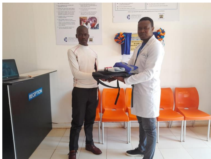
The Ogembo CHPs being equipped with essential door to door screening material

In regards to strengthening Community Eye Health, The Ogembo Vision Centre was set to initiate a door to door eye screening operation. The collaborative effort between Operation Eyesight Universal and Kisii Eye Hospital at Ogembo Vision Centre started on April 2023. The aim of this endeavor was to address eye health concerns within the community comprehensively. The door to door screening was executed by Community Health Volunteers from Mosora Sublocation and Orogare sublocation, who were equipped with necessary diagnostic tools and resources. The screening commenced on the 1 st of April 2024.