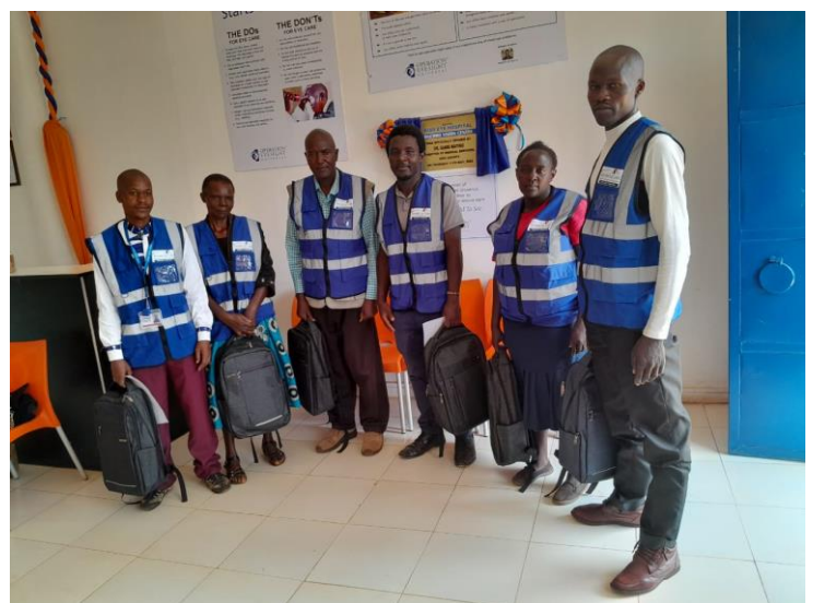
CHPs after receiving their door to door screening materials and identification material