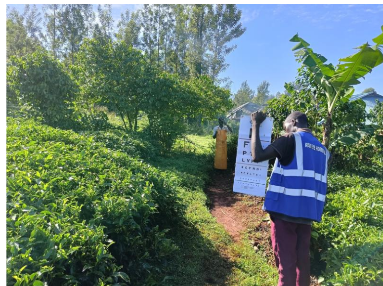
CHPs in the field doing Door to door Screening