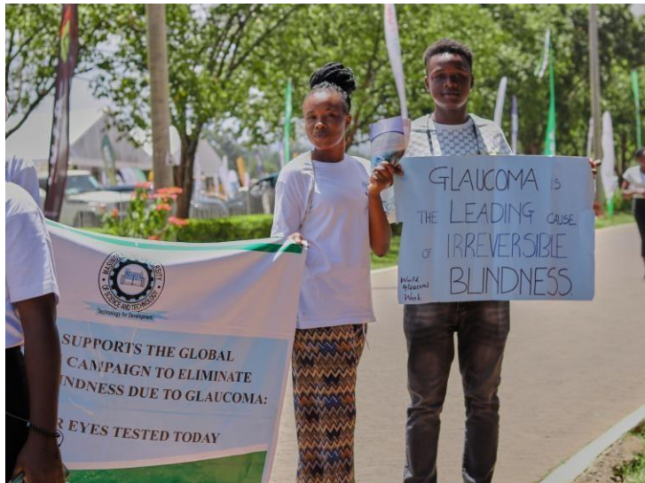
MMUST students with Glaucoma Banners