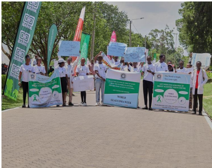
MMUST Students Taking a walk