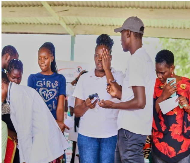
Student taking Visual Acuity