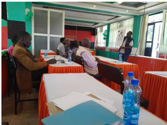
Community Health Volunteers during a Training session

We celebrate a significant step forward in our community's health initiatives: the training of volunteers to conduct eye screenings. Through workshops, hands-on training sessions, and ongoing support, volunteers are equipped with the knowledge and skills necessary to carry out their roles effectively.