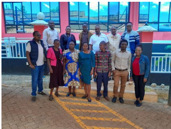
IECL Staff and Community Health Volunteers