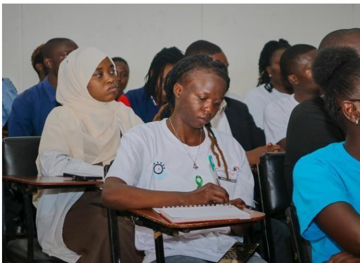
MMUST students during a Training Session

Our dedicated team from Innovation Eye Centre - Kisii Eye Hospital had the privilege of partnering with Masinde Muliro University of Science and Technology to raise public awareness about glaucoma, a leading cause of irreversible blindness worldwide. Through an engaging and informative session, our experts aimed to empower the next generation with knowledge about glaucoma prevention, early detection, and treatment options.