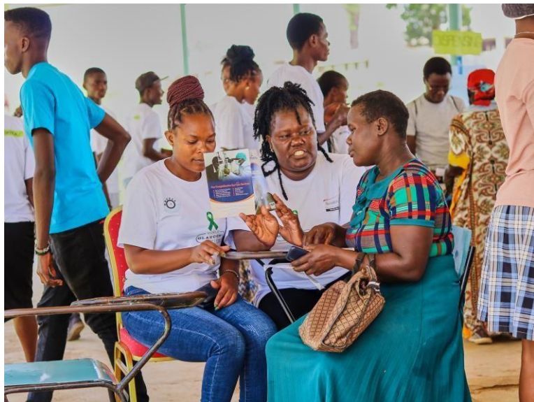
IECL Staff during an informative Session