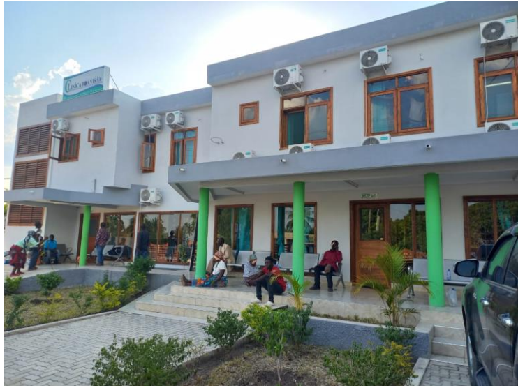
Boa Visao Eye Hospital, Mozambique