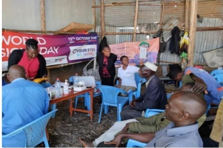
Various activities at Kenya Industrial Estate Free Screening Camp

On Monday 9 th October 2023, Kisii Eye Hospital with the partnership of Vision Spring conducted a free screening camp at the Kenya Industrial Estates in Kisii Town. Those screened included mechanics, garage workers, shop attendants and hawkers. In total 50 patients were screened.