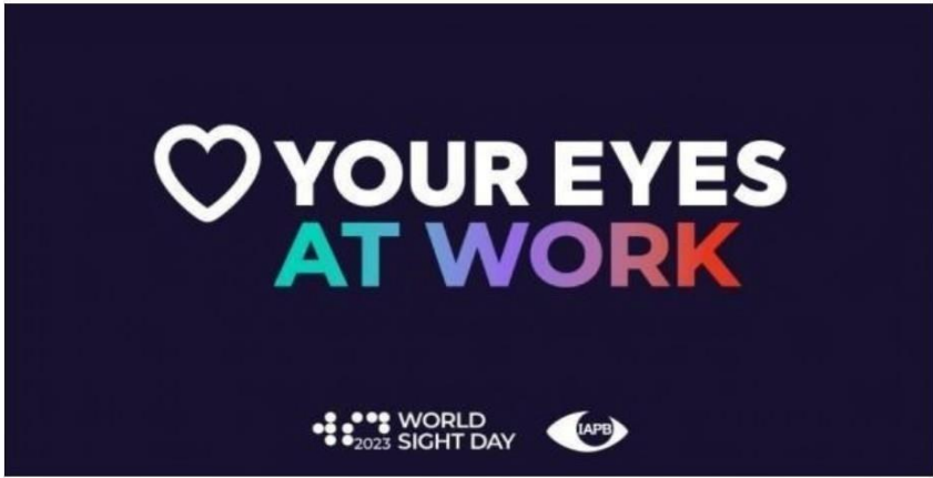
World Sight Day 2023 Theme