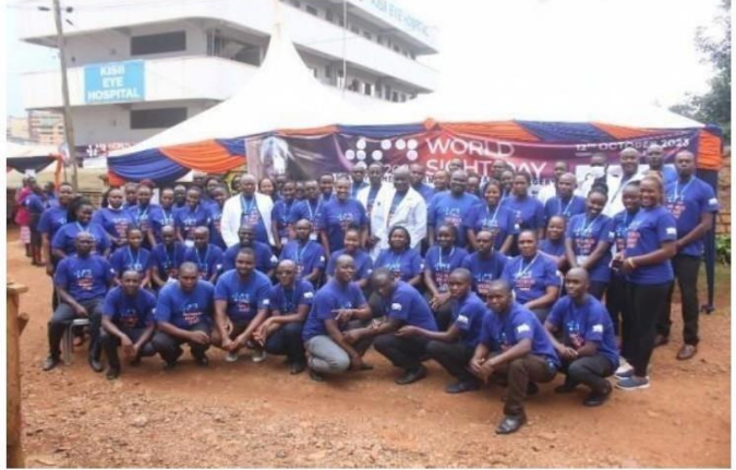
Kisii Eye Hospital Staff during the World Sight Day 2023