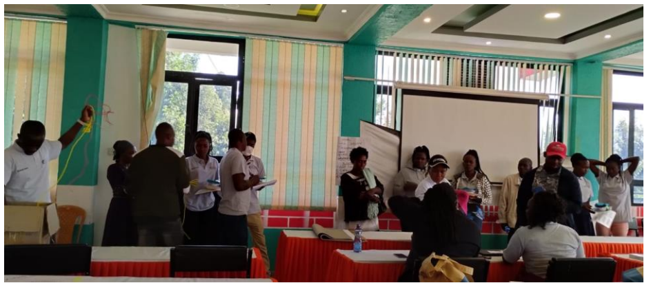
The team preparing for training at the field