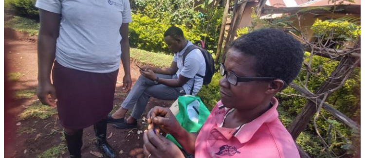
Patient sewing with glasses