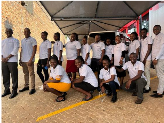
The team during training