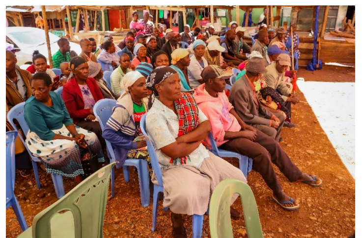
Patients waiting Bay