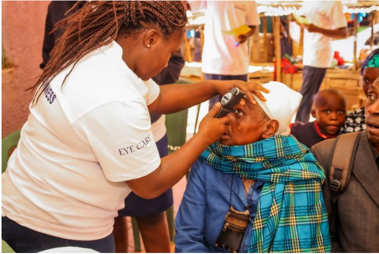
Intraocular Pressure Measurement