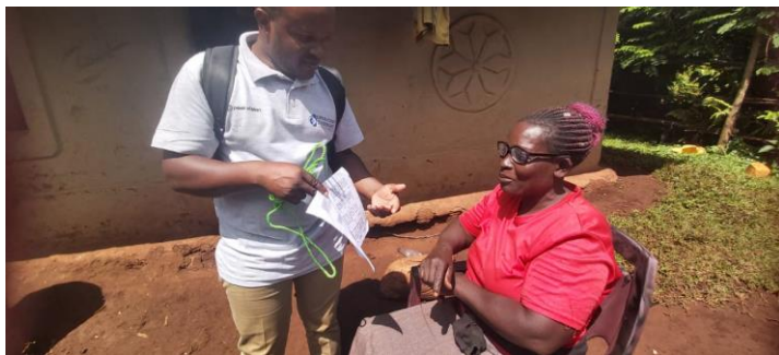
Patient reading N8 chart with glasses