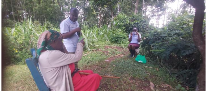
Taking Visual Acuity using peek vision application