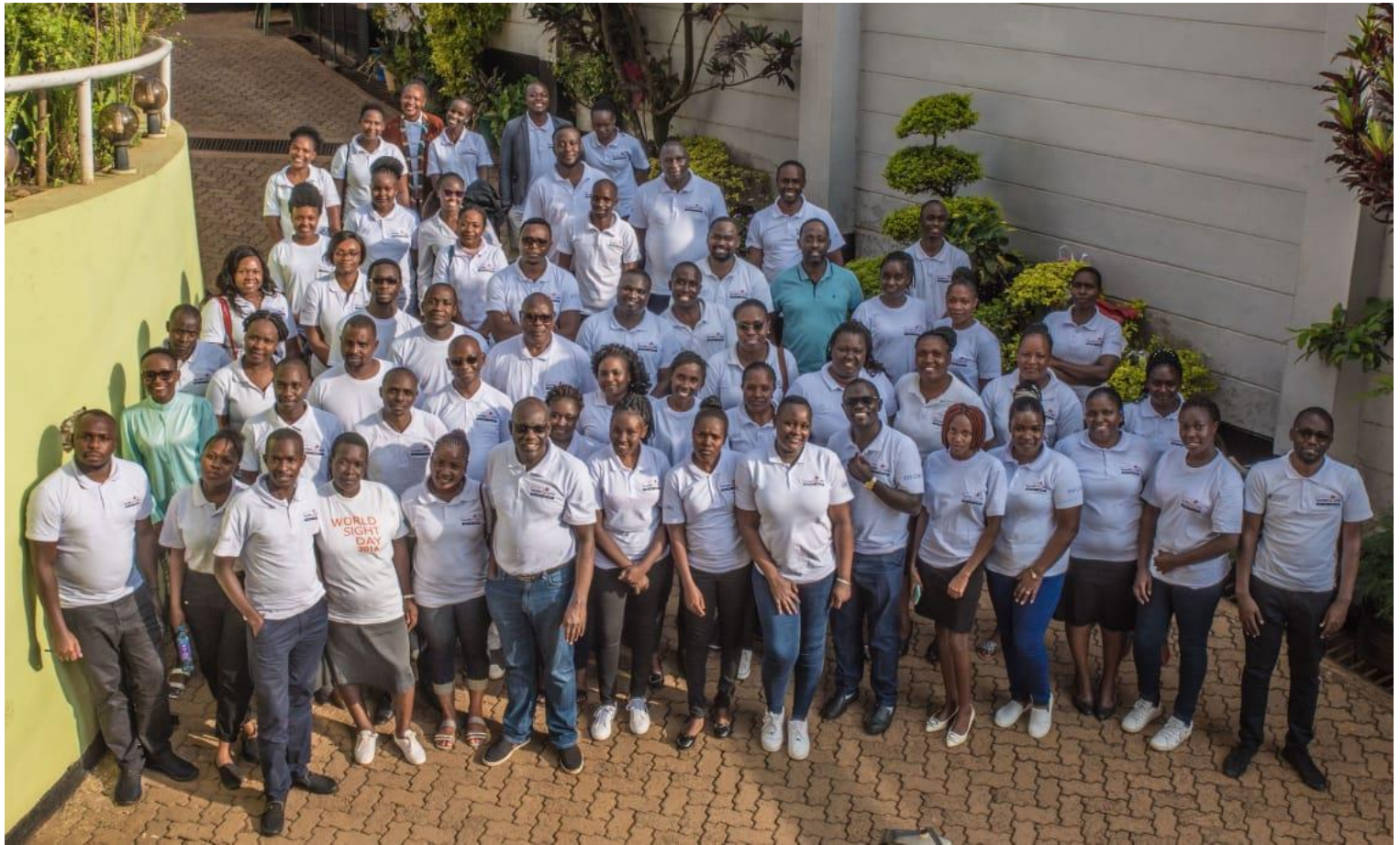
Kisii Eye Hospital Staff during the Data Protection Act training

Kisii Eye Hospital carried out a training about the new Data Protection to all its staff on Sunday 21 st May 2023.