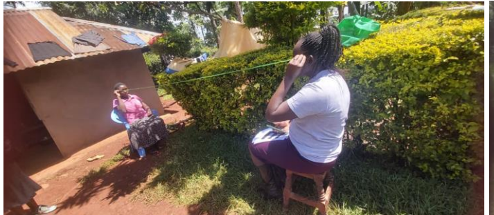
Measuring 3-meter distance