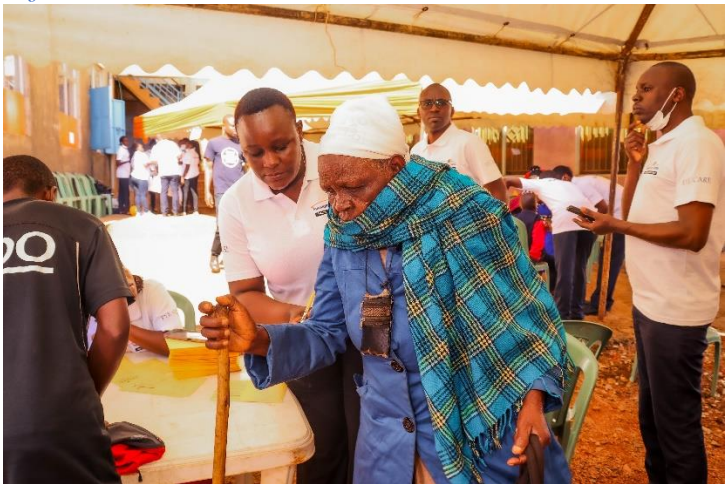
Cataract Patient being escorted