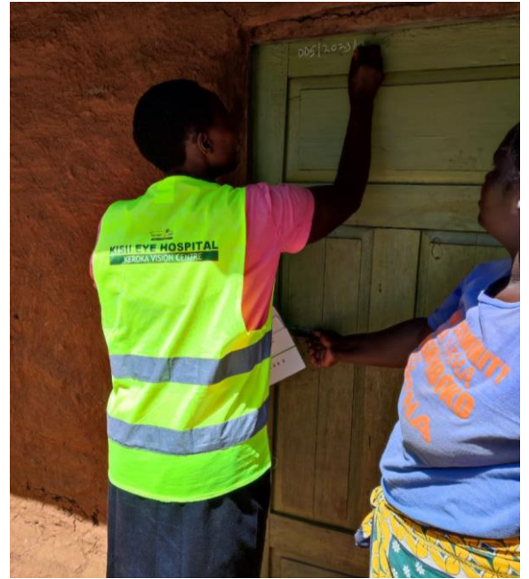
Community Health Worker at the field