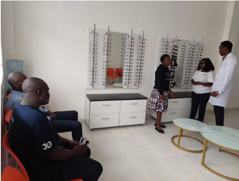
Patients waiting bay and glasses display