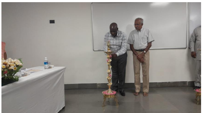
Candle lighting moments