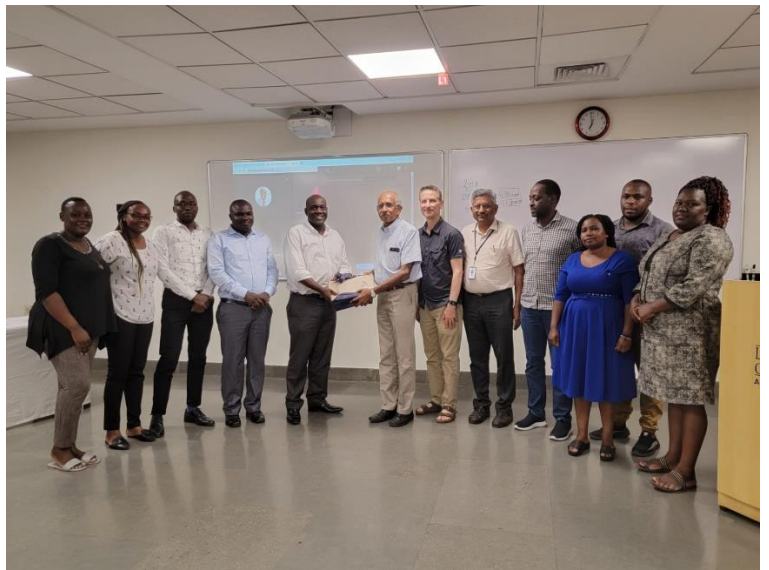
Kisii Eye Hospital Team receiving