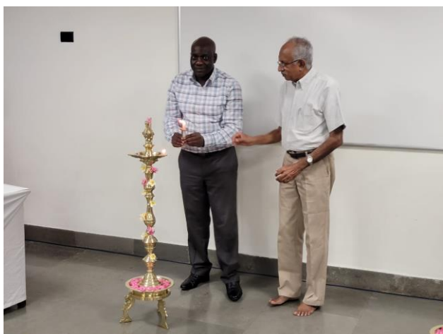
Candle lighting moments