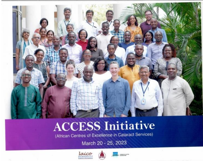
ACCESS Participants an award

A team of nine staff members of Kisii Eye Hospital visited Aravind Eye Care System in Madurai City-India for a one-week (19 th -25 th March) Thematic Workshop for the (African Centers of Excellence in Cataract Services) ACCESS project. The main topics of discussion were; Holistic approach to quality for enhanced eye care delivery, Developing empowered and engaged human resources for effective eye care delivery and the closure of the ACCESS project which was initially started in 2013.