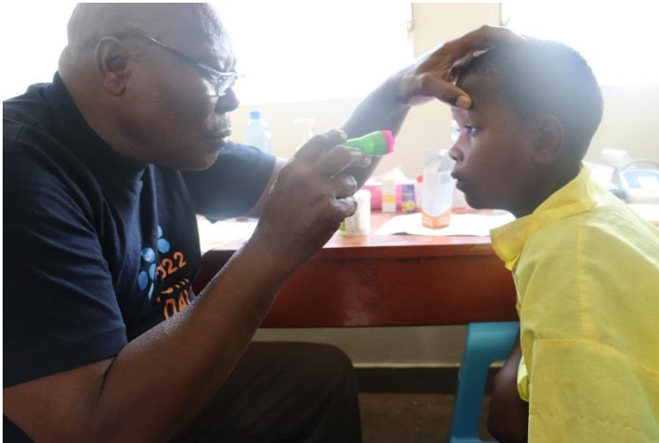
Eye examination by the doctor