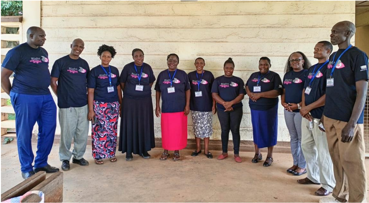
Diabetic Retinopathy screening team at Tabaka Mission Hospital