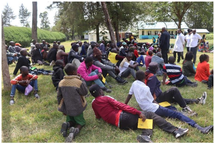
Health talk to the patients before start of screening