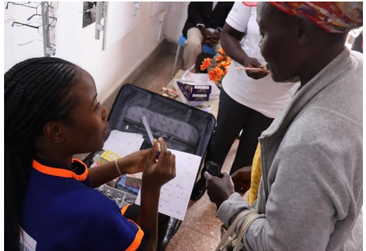
Dispensing of medicine and reading glasses