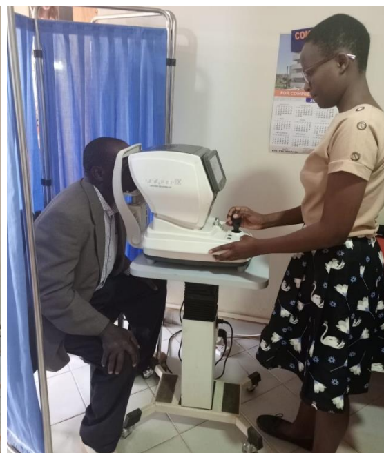
Diabetic Retinopathy patients being examined at the hospital