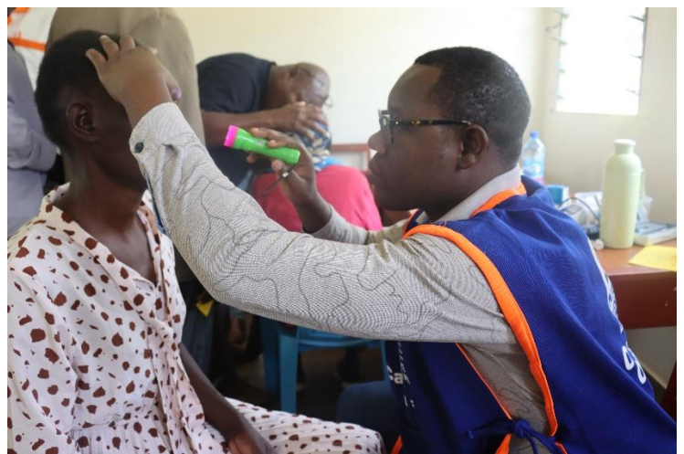
Eye examination by the doctor