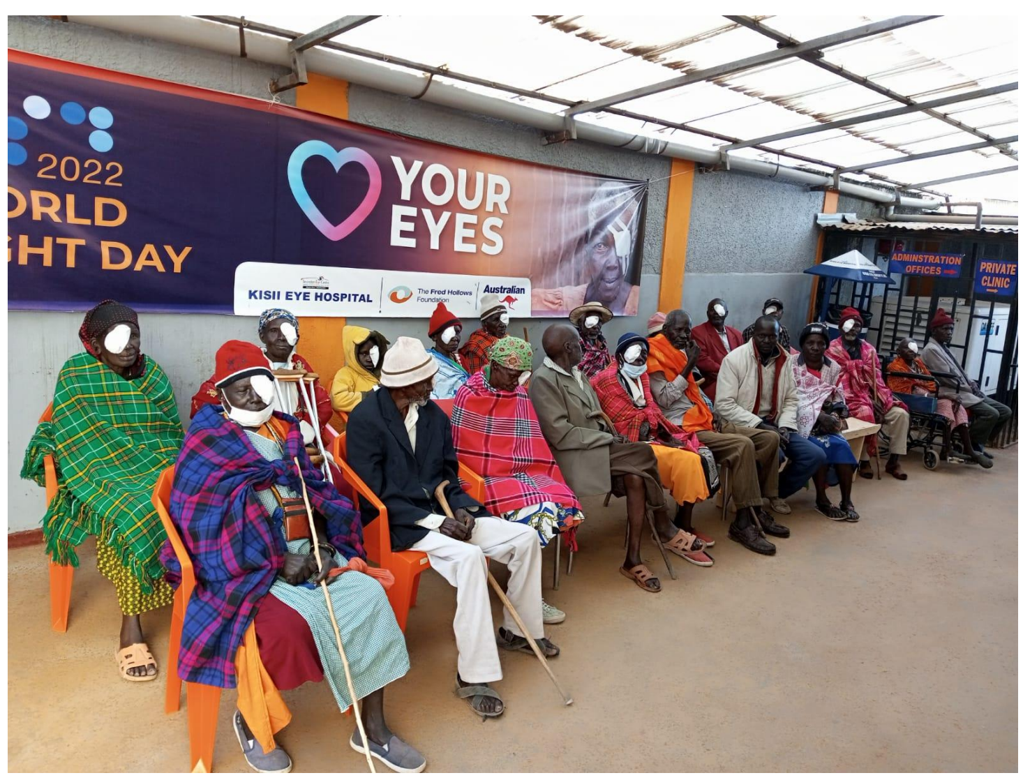
Cataract patients post op day 1 at Kisii Eye Hospital