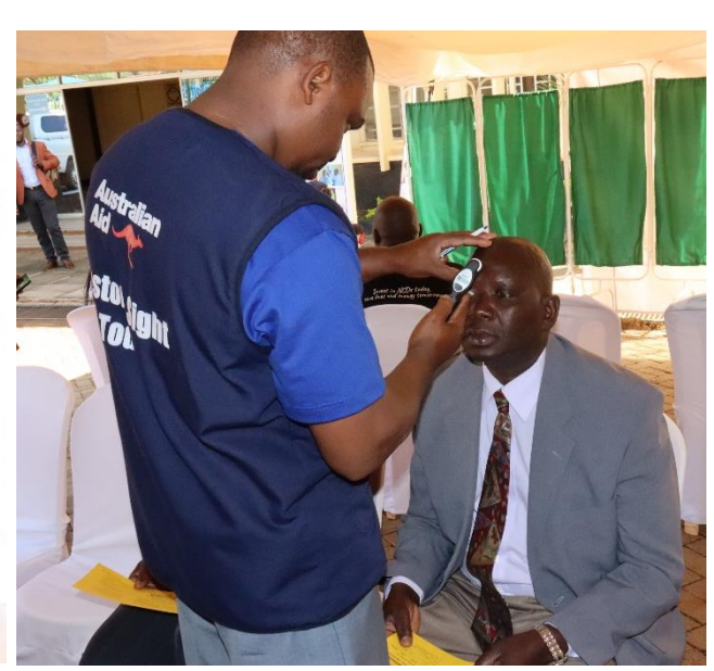
Diabetic Retinopathy Screening