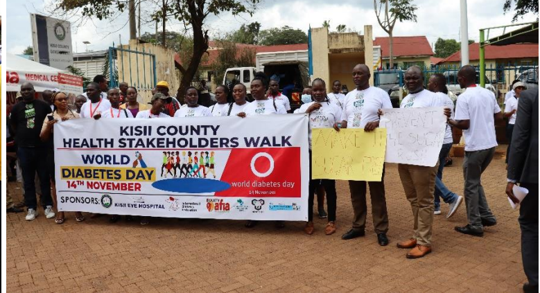
Diabetes Walk in Kisii Town