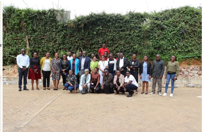
Interactive meeting with City Eye Hospital and Kisii Eye Hospital staff about Vision Centre Set up