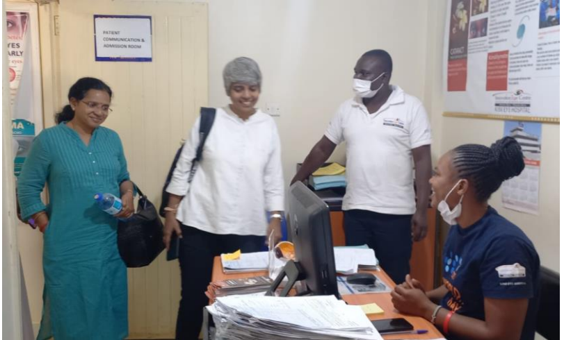
Orientation at the Base Hospital