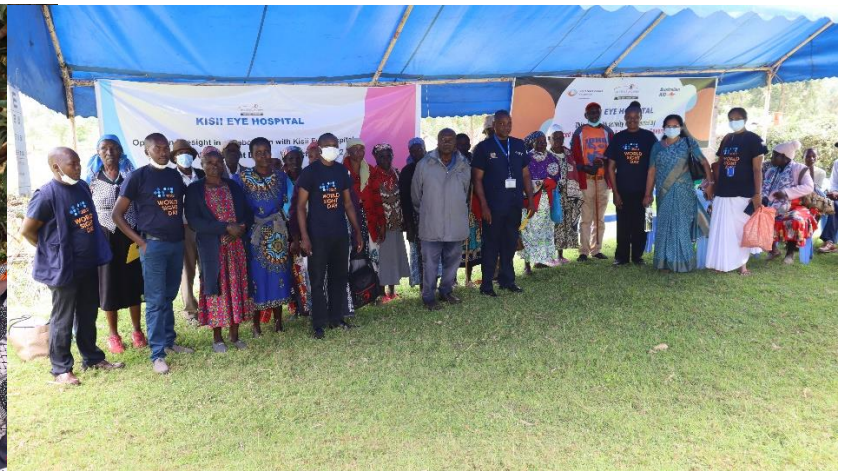
Visit at Rigoma Camp during World Sight Day 2022 celebrations