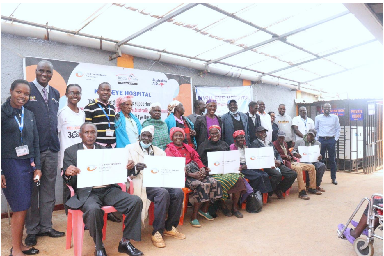
Happy Cataract patients post op day 1 at Kisii Eye Hospital