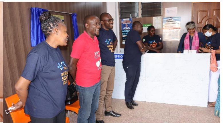
Visit to Keroka Vision Centre