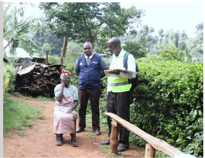
Visual Acuity taking