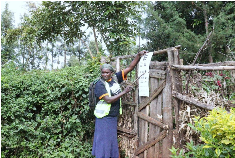
Visual Acuity taking