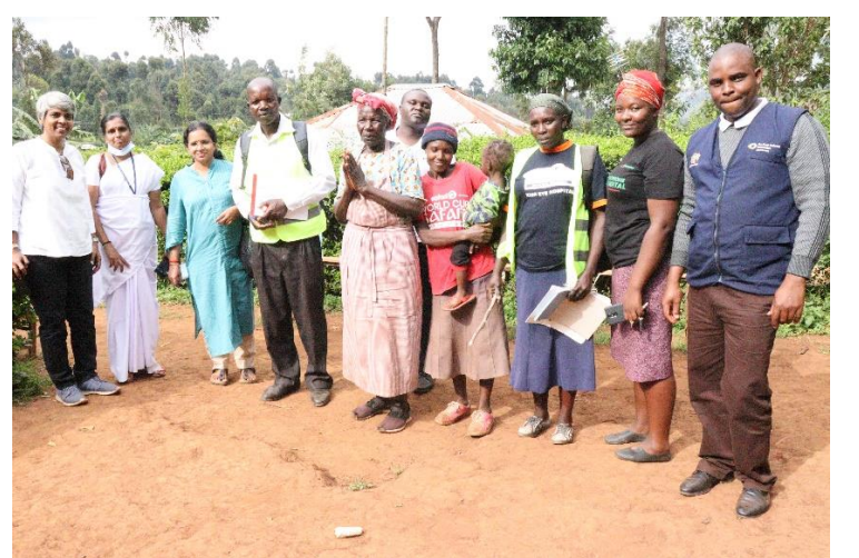
Visit to the Community Health Volunteers at the field