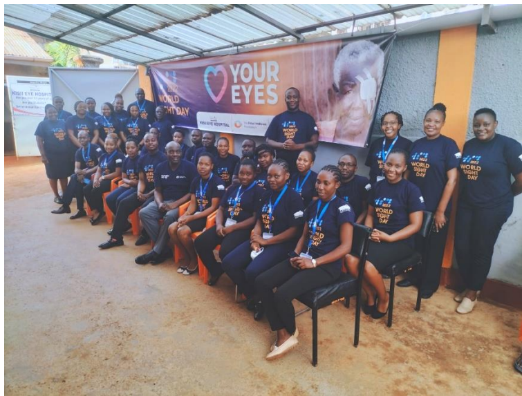
Kisi Eye Hospital staff during World Sight Day