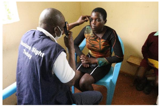
Various activities at the camp