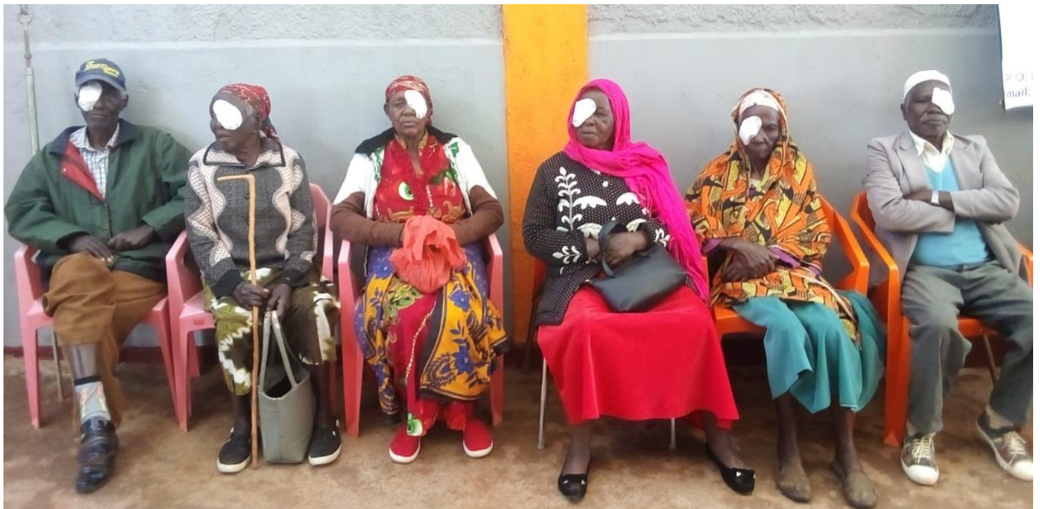
Cataract surgery patients from Nyamira North Subcounty after cataract surgery post operative day 1