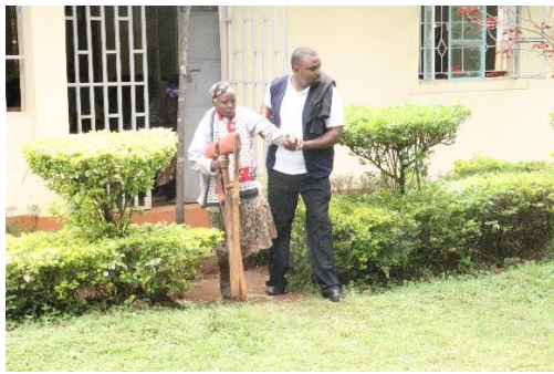
Various activities at the camp