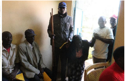
Various activities at the camp