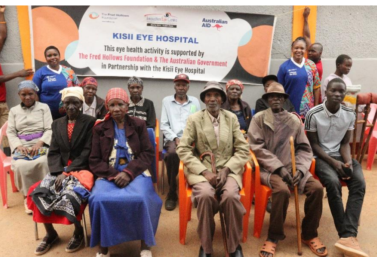
Kisii Eye Hospital Cataract Patients before surgery