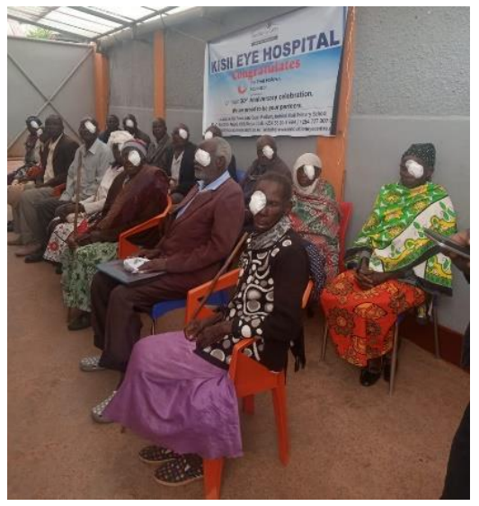
Camp patients after cataract surgery post operative day 1