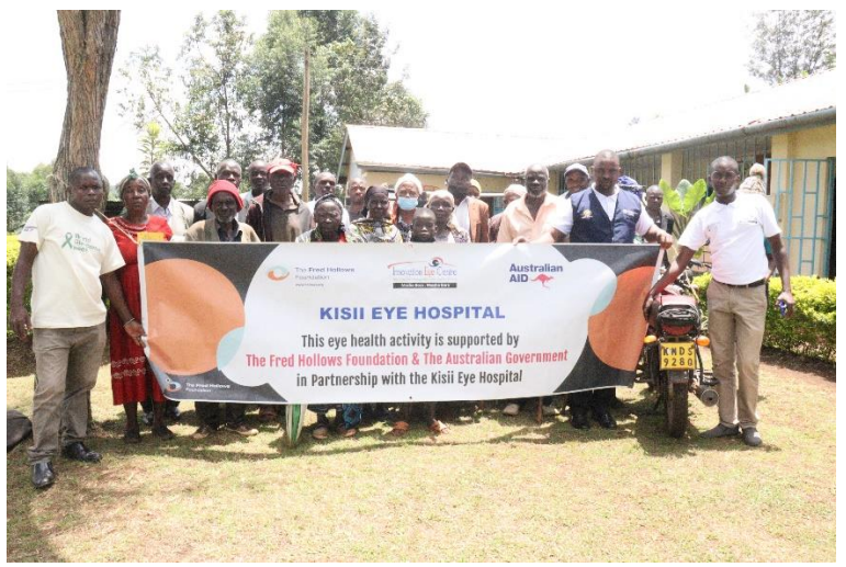
Cataract Patients at Kisii Eye Hospital before surgery Cataract Patients at the Gotichaki camp before surgery