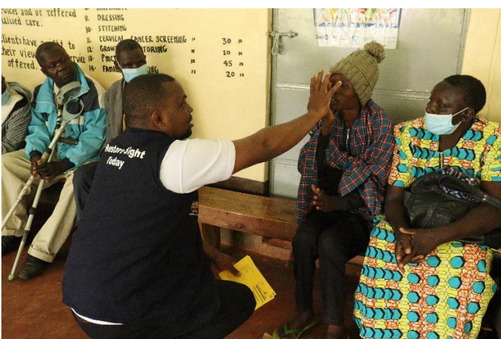
Visual Acuity taking at the camp