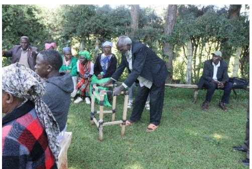
Various activities at the camp