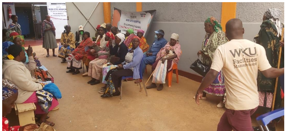
Cataract patients after surgery from Magenche Camp