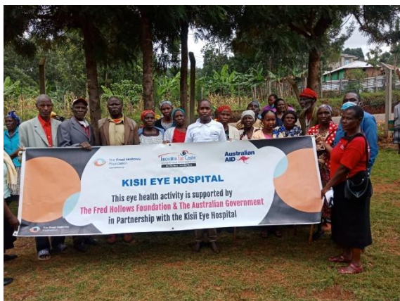
Cataract patients at the Magenche camp site