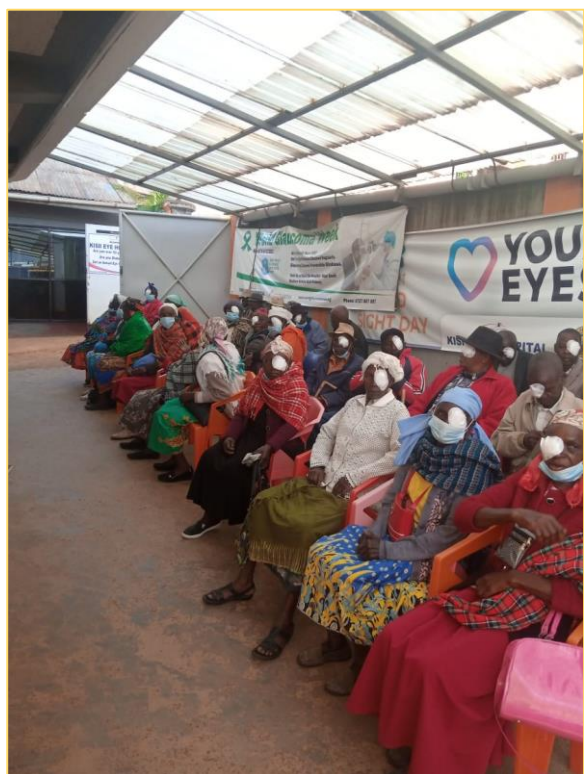
Patients from camp at the base hospital for cataract surgery