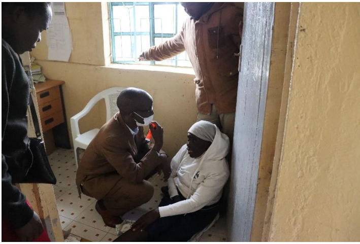
Various Activities during the eye camp