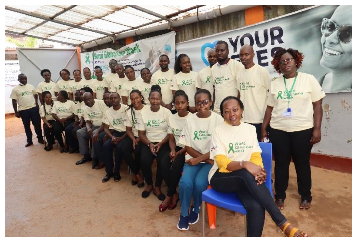
Kisii Eye Hospital Staff during Glaucoma Day