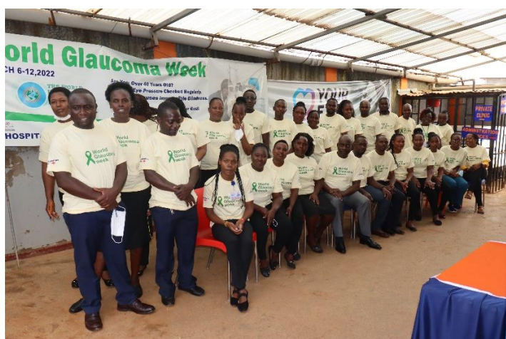
Kisii Eye Hospital Staff during Glaucoma Day