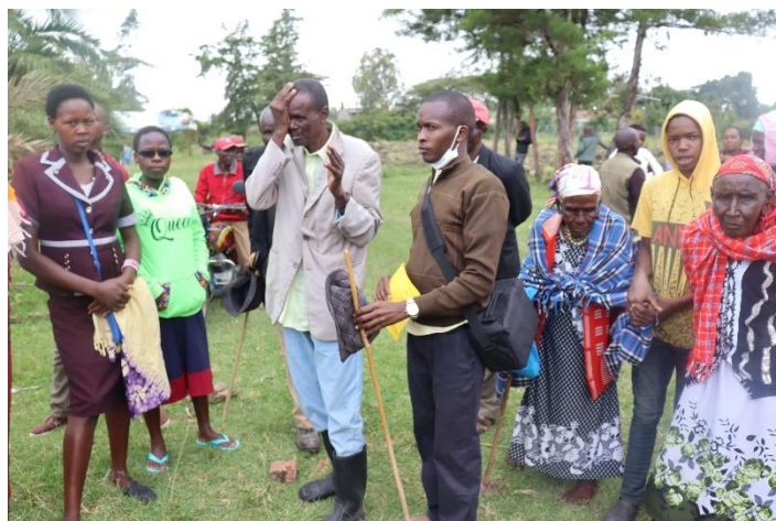
Various Activities during the eye camp