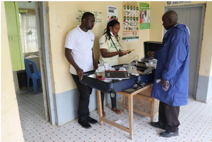
Various Activities during the eye camp