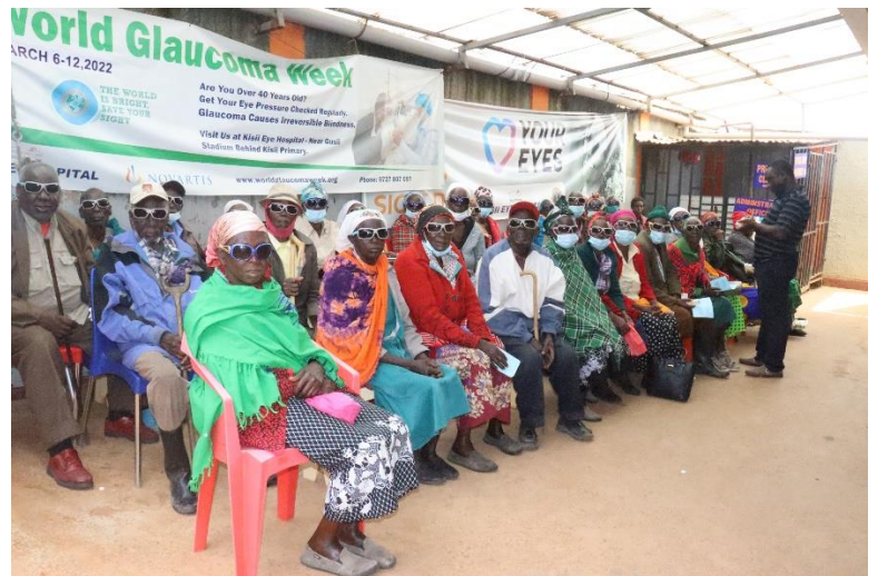
Happy patients after cataract surgery