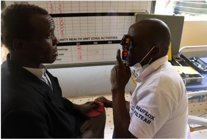
Various Activities during the eye camp