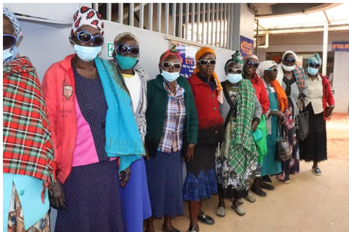
Happy patients after cataract surgery wearing the sunglasses