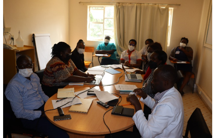
Fred Hollows Presentation