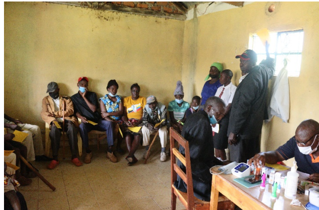
Various Activities during the camp