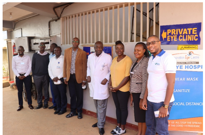
COECSA Team with Kisii Eye Centre Staff and students during the assessment