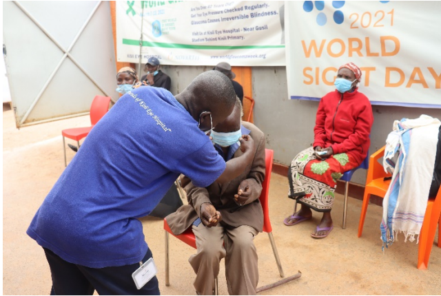
Various Activities during the camp