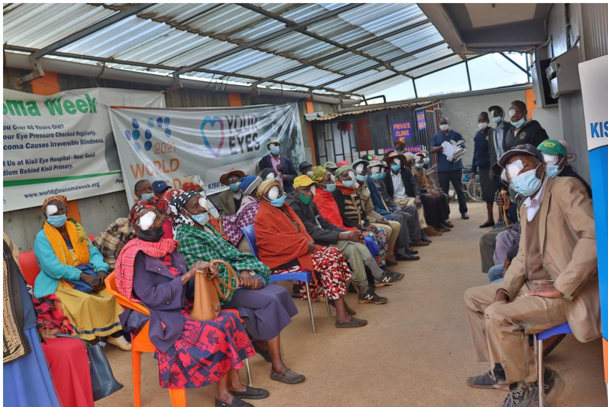
Patients from Kipwastuiyo camp after surgery

Our utmost gratitude goes to Fred Hollows Foundation for the total support we have received towards our community outreach programs. In this month of December, we held an outreach at Kipwastuiyo Subcounty Hospital in Kericho County. We were able to screen 177 patients whereby 43 patients were admitted for cataract surgery in our hospital.