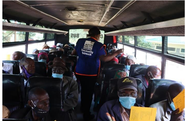
Patients being ferried to Kisii Eye Hospital