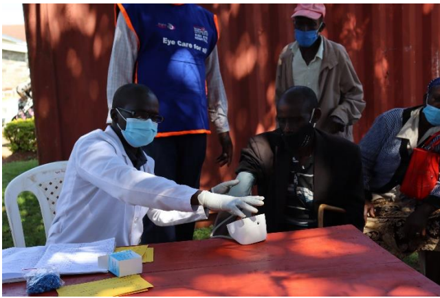
Various activities at the camp site