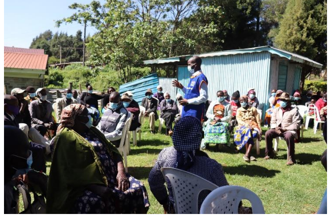
Various activities at the camp site