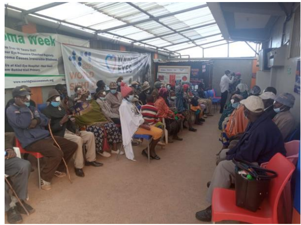
Patients after Surgery