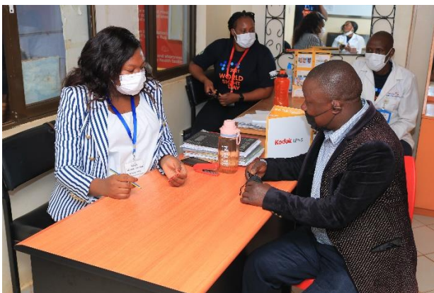
Optical Shop Sales