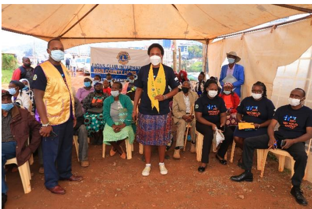
Our Partners-Kisii County Lions Club