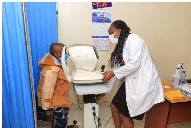
Autoref Examination at the optical shop