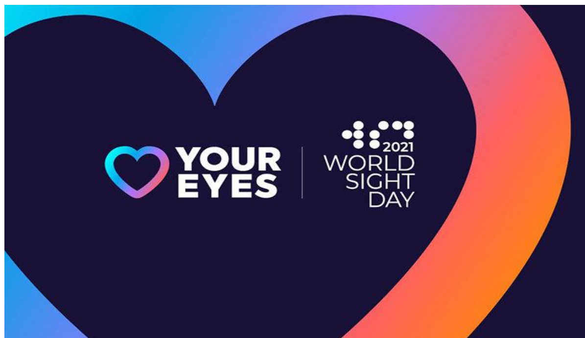
World Sight Day 2021 Theme