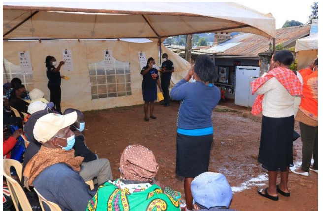
KEH Nurses taking Visual Acuity