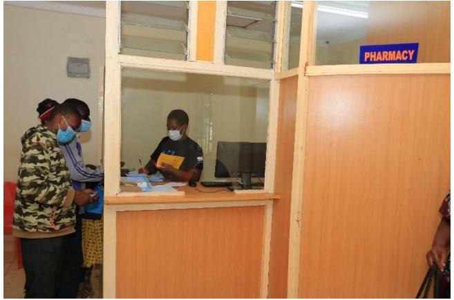
Dispensing medicine at the Pharmacy