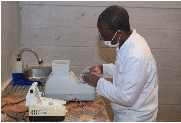
Glazing at the Optical workshop