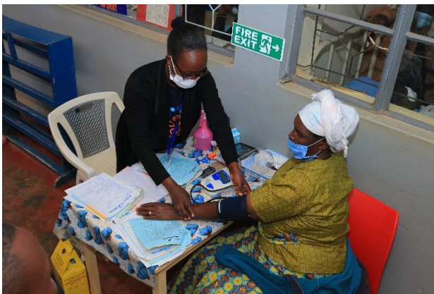
Preparing patients for surgery