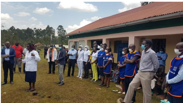
Tongeri Health Care Camp