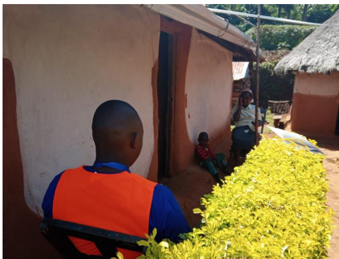
Cataract Finders conducting door to door screening