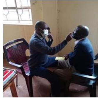
Outreach Team at the mini camp