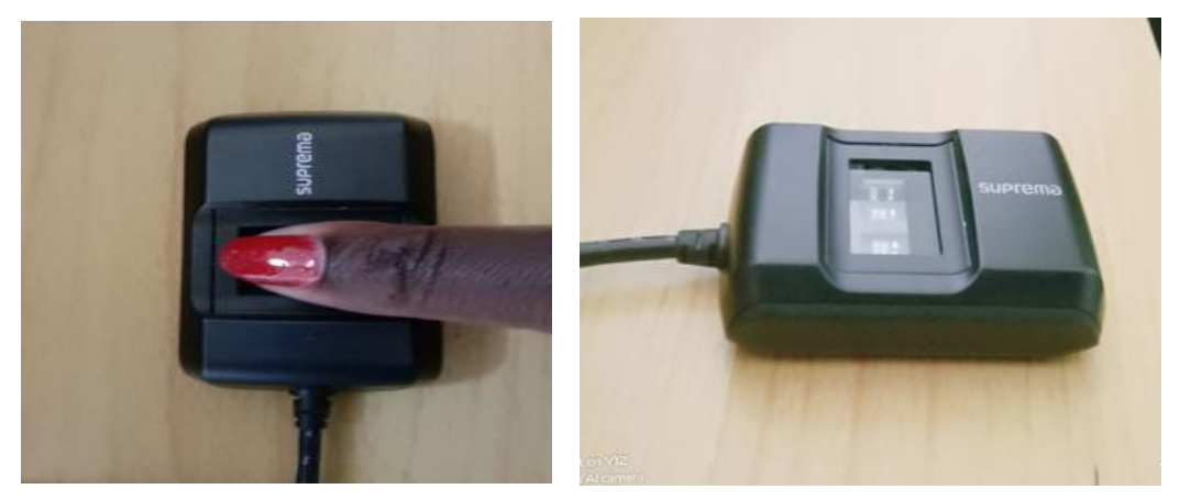
Biometric verification machines

We are happy to announce that we have already complied with the NHIF system upgrading use of biometric verification. This has been in effect from 01/05/2021. This upgrade is a sure step of patient authentication to avoid fraud and also to offer better and more efficient services to you.