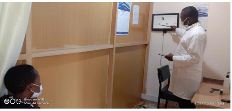
Mr. Oloo performing visual acuity of a patient