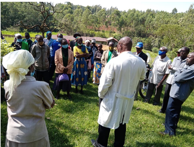
OCO Makamara offering patient education to patient at Sengereri Village during a mini camp.

In the month of April we conducted mini camps in Nyakoe [Kisii County] and Gachuba [Nyamira County]. Our doctors diagnosed the patients, prescribed drugs, and also referred some of them to the hospital for further treatment.