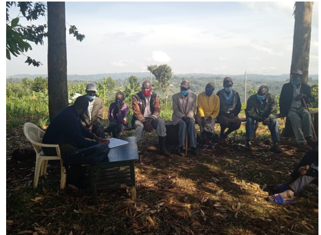
Patient registration in one of the mini camps at Nyabondo PAG church, Mosocho Division, Kisii County.