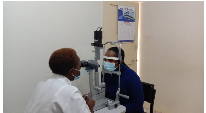
Ms. Muiruri examining a patient using a slit lamp