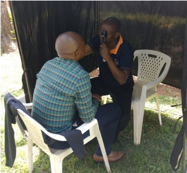
Mr. Chemoror performing retinoscopy to a patient at Sengereri village mini camp.